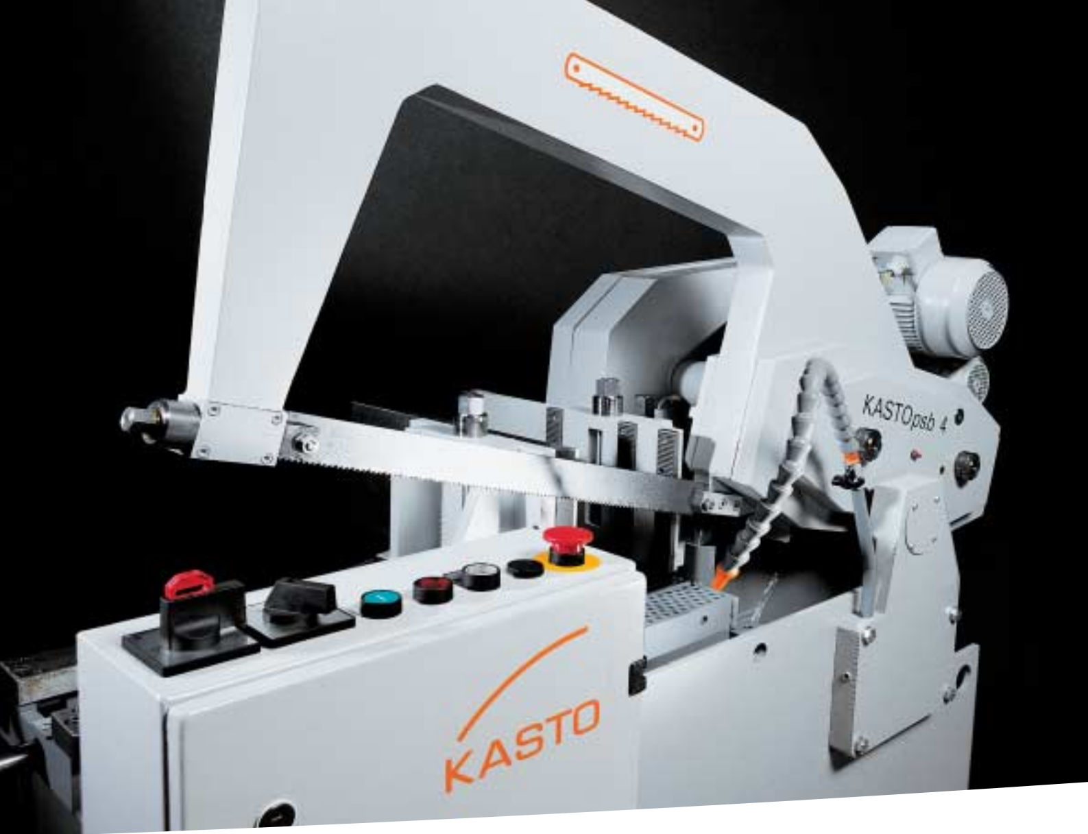
KASTOpsb 4: With KASTO Universal Hydraulics UH for different cutting applications.

Robust technology, excellent equipment: KASTOpsb.